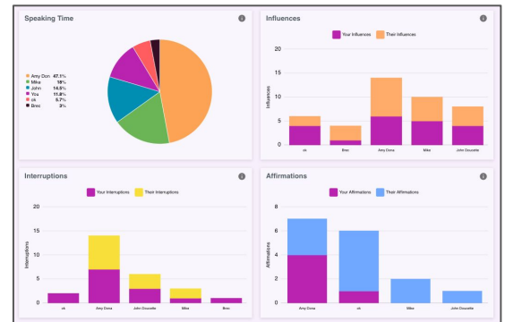
Riff Metrics — Speaking Time, Influence, Interruptions & Affirmation

Riff Teams provides video and text chat apps seamlessly integrated with Open edX (and other LMSs). Riff looks and feels like what we use at work, but also engages participants by giving them immediate and longitudinal insights about their interpersonal behaviors, raising awareness of common traits such as dominance or bias. Riff then makes recommendations about how to be more successful working with others.