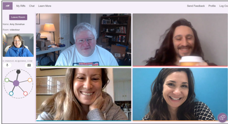
Riff Video Chat & Meeting Mediator